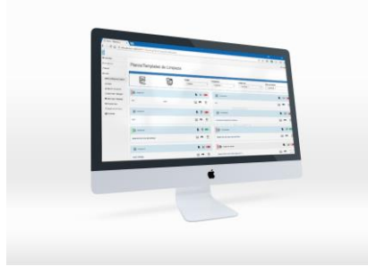
Frontend ( Dashboard )